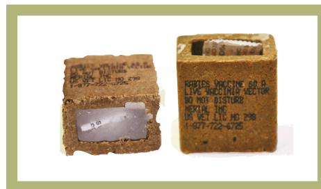
RABORAL fishmeal polymer.

For any additional questions or concerns regarding the baiting program or RABORAL V-RG call 1-877-RABORAL (1-877-722-6725).