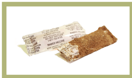
RABORAL coated sachet

Although RABORAL V-RG will not harm your dog or cat, the vaccine does not replace conventional rabies vaccines. Only rabies vaccines administered by veterinarians are considered to be proof of vaccination for domestic pets.